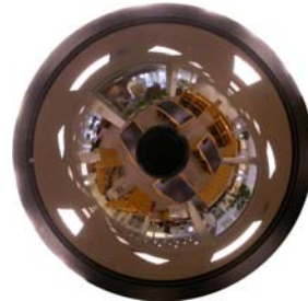
Circular Image from Parabolic Mirror Lens